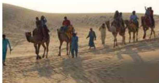
RAJASTHAN EDUCATIONAL TRIP