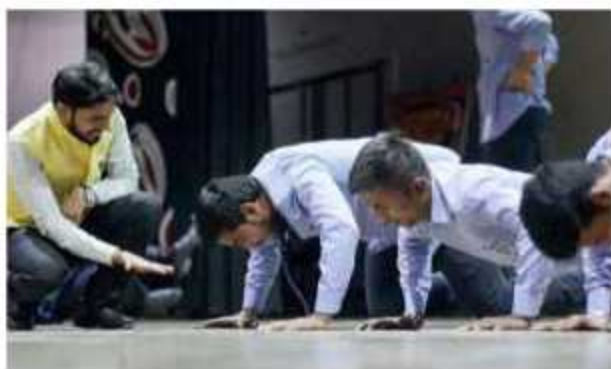
PHYSICAL WORKOUT SESSION