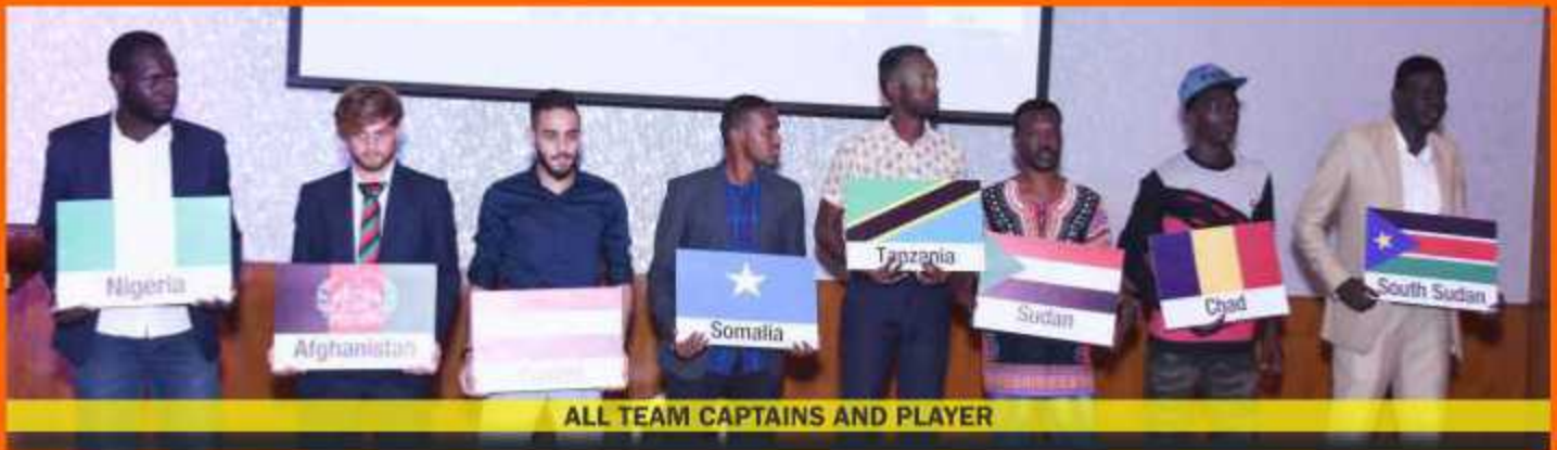
ALL TEAM CAPTAINS AND PLAYER