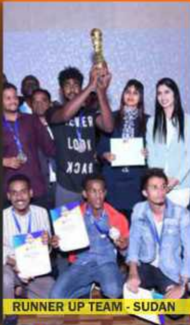
RUNNER UP TEAM - SUDAN