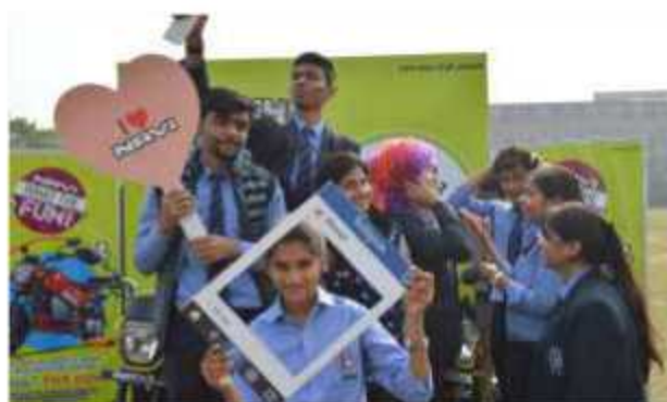
RADIO CITY WORKSHOP