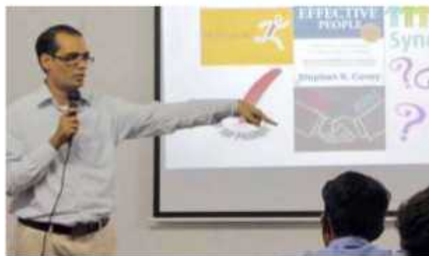
PROFESSIONAL GUEST LECTURE

Guest lectures and workshops are conducted regularly to inculcate the spirit of learning and impart education from outside the classroom. Various workshops were conducted with collaboration with corporate organizations like TCS and HCL on the topics of creative writing, hardware training, 'PHP' training, Ethical hacking etc. Industrial visits are conducted to impart practical aspects of learning to the students. The latest visits were made to the Leather factory and Ashapura stones in Rajasthan.