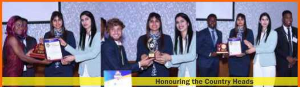
Honouring the Country Heads