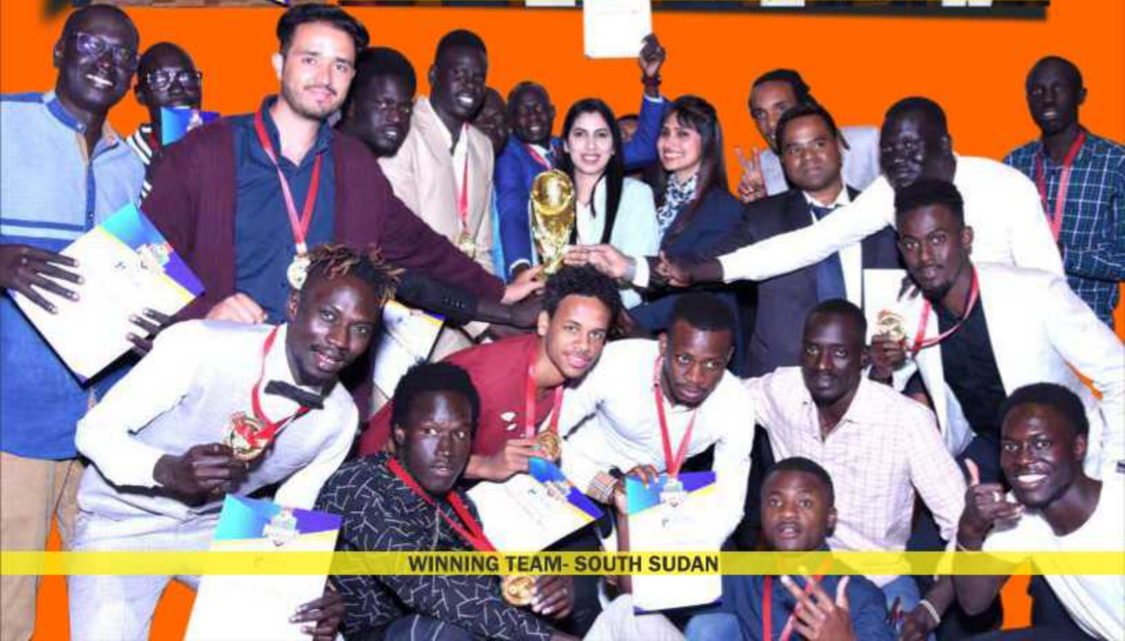
WINNING TEAM- SOUTH SUDAN