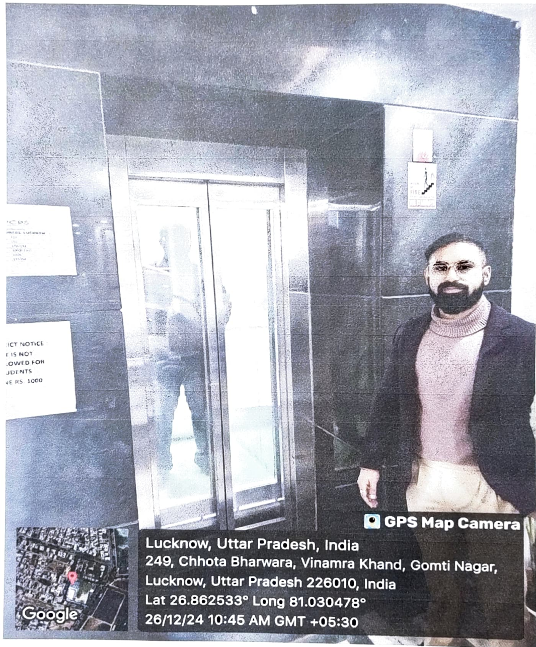
(Lift Facility for Persons with Disabilities: Easy access to the academic building)