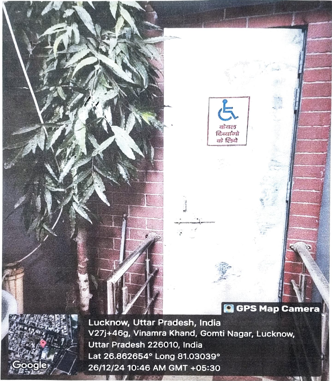
(Accessible Washroom for Differently-Abled Individuals)